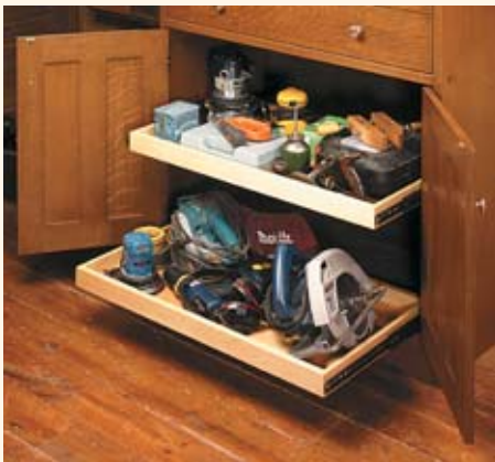
Heavy-Duty Trays hold portable power tools and other accessories. Now nothing will get lost in the back of the cabinet.