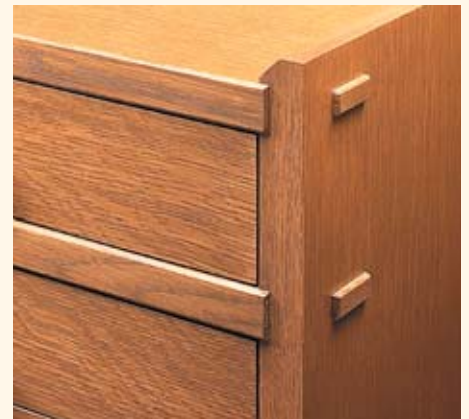
False Tenons give the look of more complex through-mortise and tenon joinery. Chamfered edges add a nice detail.