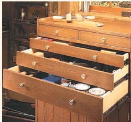
Easy-Access Drawers travel on smooth-riding slides. The shallow drawers make finding and organizing tools a snap.