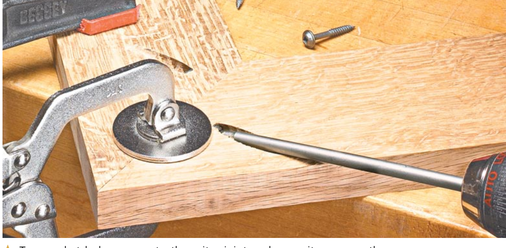
▲ Two pocket holes square to the miter joint and opposite one another allows pocket hole screws to secure the joint. A face frame clamp makes it easy to hold the joint in position while the screws are inserted.

If you're concerned about wood movement, drill the pilot holes in the edge a little oversized. Then after driving the screw,