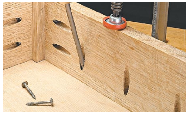
Attach a table top by drilling pocket holes and driving screws. Drilling the pilot hole a bit larger and backing the screw out slightly, allows for wood movement.

As you can see, pocket hole joinery has many uses. The joints are strong and they look great. You'll be surprised at how many uses you come up with in your own shop for this quick and easy joinery.