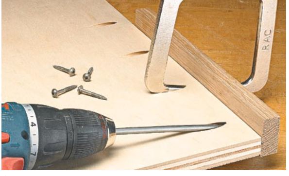
▲ Pocket holes are a great way to secure edging to a shelf. A right-angle clamp holds the edging to the shelf while the screws are driven in place.