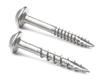
▲ Thread Type . Fine threads (top) are used for hardwood and course threads are for softwoods and plywood.