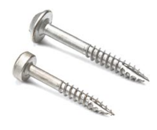
▲ Head Style. Use washer head screws (top) for plywood and softwoods. Pan head screws (bottom) are for hardwoods.