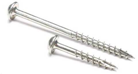
Screw Length. Screws are available in many sizes so you can match the screw length to the thickness of the workpieces.